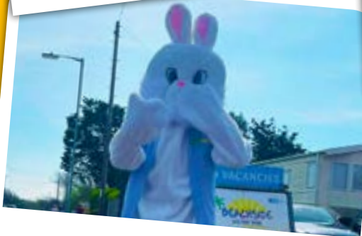
Easter Egg Hunt