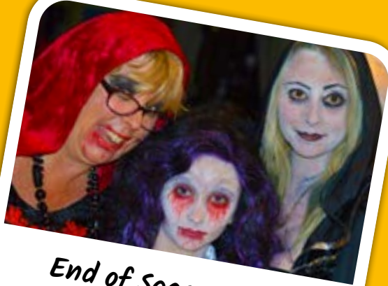
End of Season Party