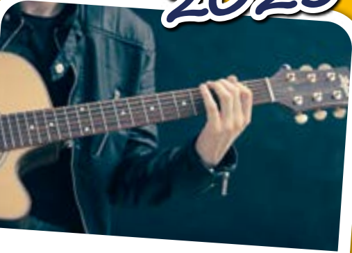
Country Music Festival